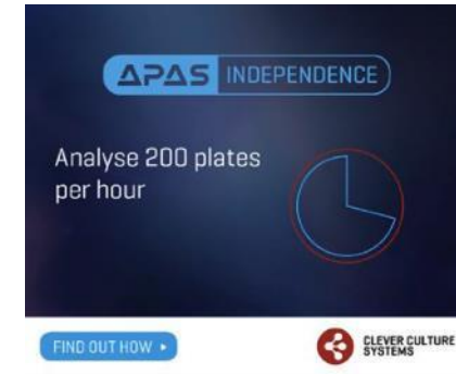
Online banner advertisements